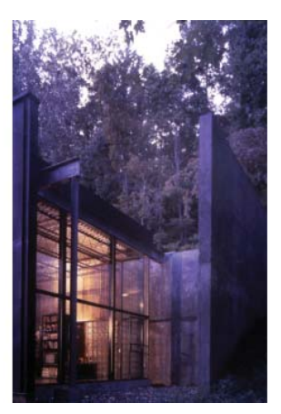
Parcel X North Garden, Virginia 1994